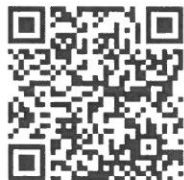
Our Lady of Mercy VANCO QR Code